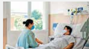
HOSPITALS & CLINICS