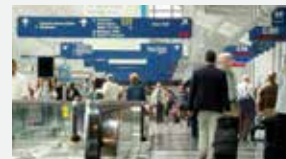
AIRPORTS AND FIELD TESTING