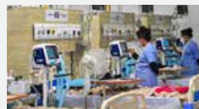
MEDICAL EMERGENCY WARDS