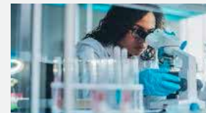
LABORATORIES, MOBILE VANS & COLLECTION CENTER